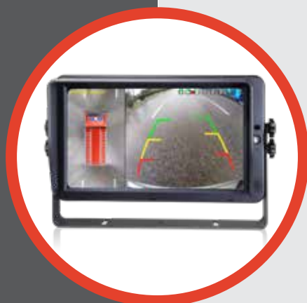
High Resolution Monitor