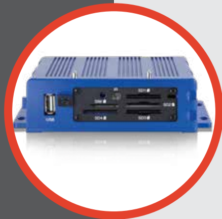
Electronic Control Unit (ECU)