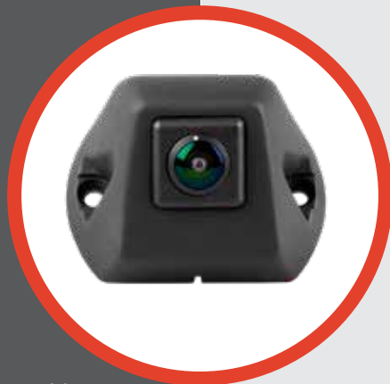
Ultra-wide 1080p Camera with Housing (4)