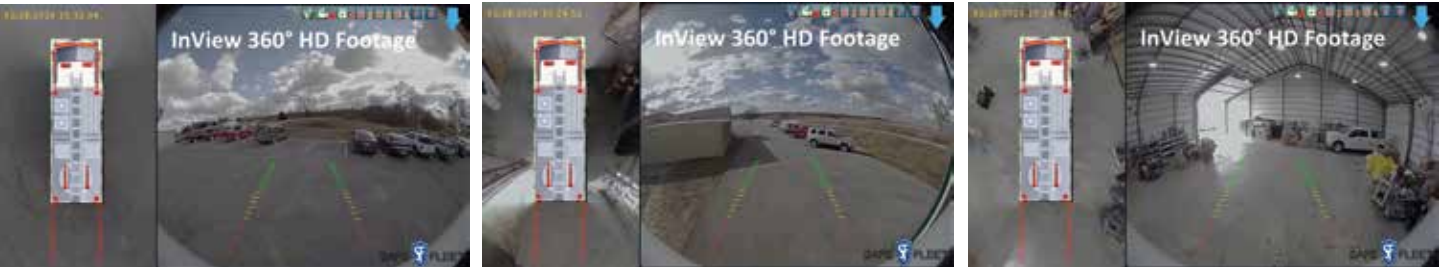
Four cameras placed around the apparatus capture a 195° ultra-wide angle view of each side of the apparatus.