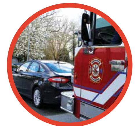
Maneuver into compact parking spaces