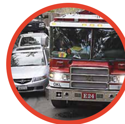
Navigate tight roads

BCA22option-PX1 Video, TrueSight, Wireless Sensor Proximity w/Display, 2 Cameras