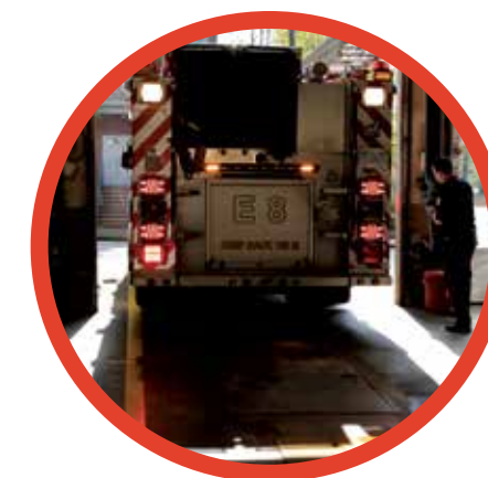
Easily back up into narrow parking bays